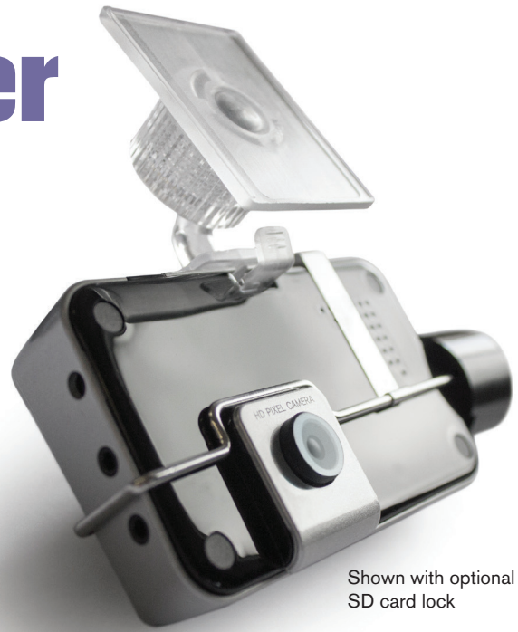
Shown with optional SD card lock

A screen-mounted, high definition digital recorder for front view event capture. Continuous or event-triggered recordings are made to a lockable Micro SD card. A GPS receiver allows the location of events to be accurately monitored. An optional second camera allows an additional view to be recorded.