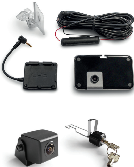
Optional second camera